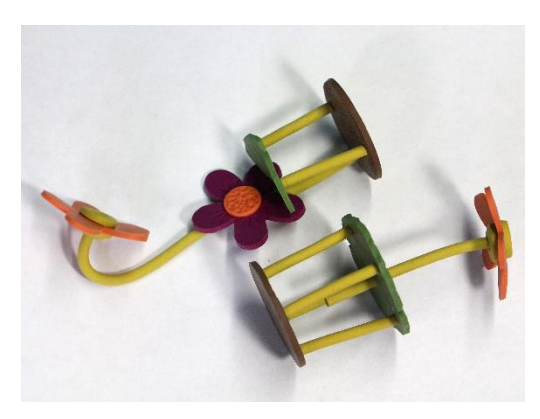
Step 22: If desired, glue the brown circles to the bottom of the chairs and umbrella. This will help support the furniture if you lightly bury the circle in the soil.

Copyright 2015 syndee holt. Please don't reproduce without permission.